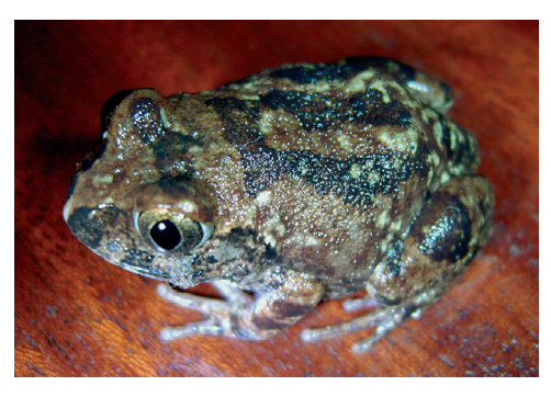
Fig. 7. Leptopelis bufonides is a very patchily distributed savanna frog, occurring from Senegal to northern Cameroon. The record from the Touri Dam is a first Guinean record. This individual shows an unusual pattern with yellowish spots on the back.

River. The area around these rocks was rather open and frequently visited by humans who crossed the river exactly where Conraua sp. occurred. As rainfall was still rare, we were not able to observe if the habitat preference of the frogs changed with a rising water level