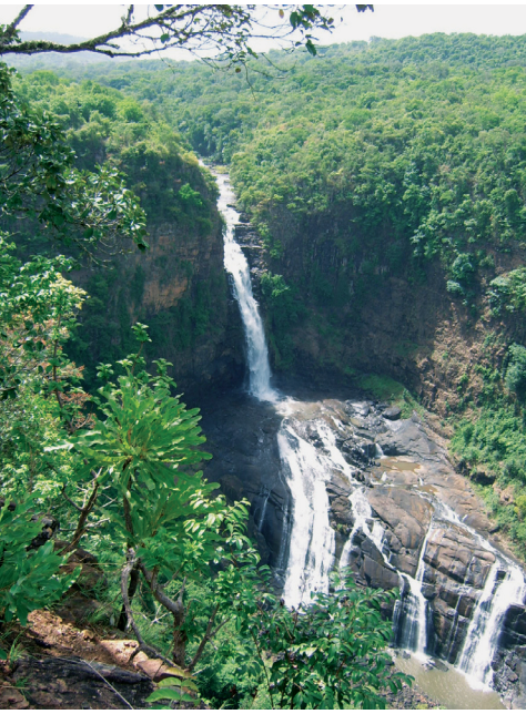
Fig. 3. Saala River and Saala Waterfall, the habitat of an undescribed Conraua species (see Fig. 5).

the formation of ponds and puddles. In some parts of Nialama the landscape was characterised by bowal areas. Some open savanna and farmbush areas served as pasture land.