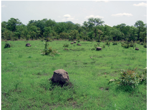
Fig. 2. Two typical aspects of the landscape in the Nialama Forest area; the open dry forest and the "bowal" savanna.

crosses the river. There is ongoing construction of a tourist camp, while no measures have been taken to cater for waste or sanitary infrastructure. The forest around the Saala Waterfalls still harbours a big population of chimpanzees (E.O. TOUNKARA, pers. comm.) and an ornithological survey revealed a high diversity of birds (N. Keita & R. Demey, pers. comm.).