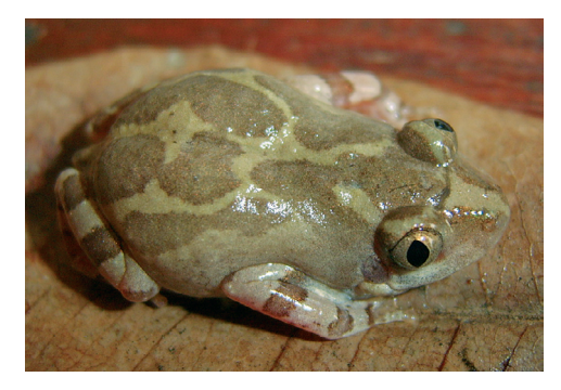
Fig. 6. Kassina fusca from the Nialama Forest area. This is a relatively common West African savanna species, herein recorded for the first time in Guinea.

The majority of species (14 species, 56%) has a distribution range exceeding West Af-