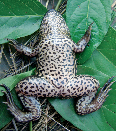
Fig. 5. Dorso-lateral and ventral view of an undescribed Conraua species from the Saala Waterfalls (see Fig. 3).

7) around the Touri Dam. Based on their general distribution area, both species were supposed to occur in Guinea (RÖDEL 2000). Kassina fusca was represented by individuals that were unusually small. Male K. fusca reached 27.5-32.5 mm SVL (N = 5; 31-35 mm according to RÖDEL 2000), while a female measured 30.4 mm SVL (32-37 mm according to RÖDEL 2000; 29-33 mm SVL for both sexes according to SCHIØTZ 1967).