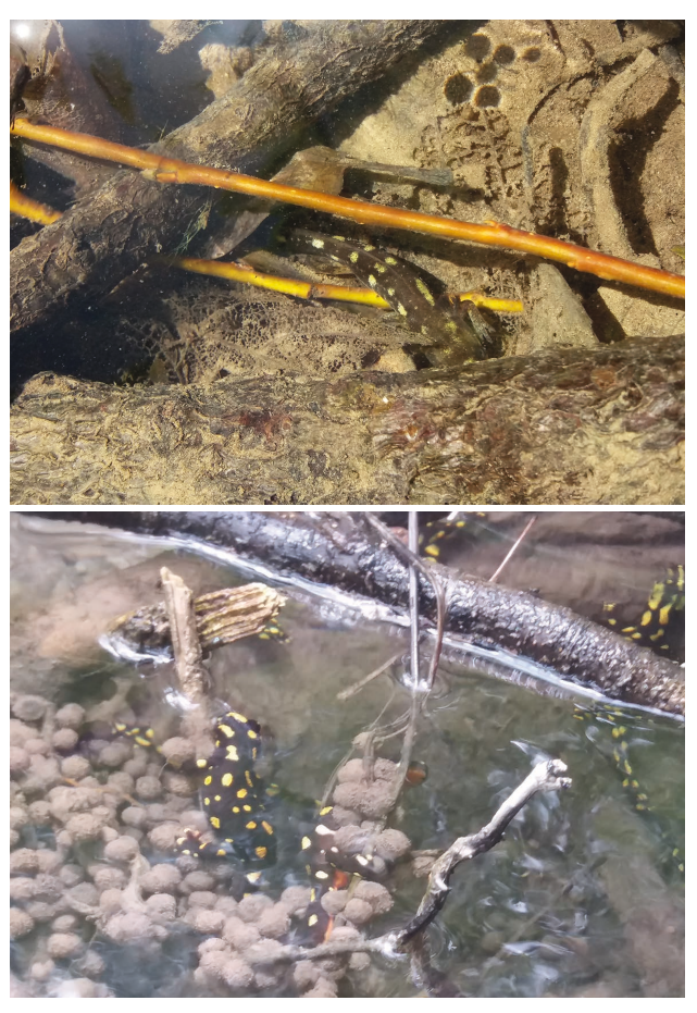
Figure 3. Camouflaged larvae and spawn on submerged branches, 17 May 2020.

restrial habitats adjacent to the streams ranged from treeless floating meadows to dense oak forests. In the study area, the values of pH ranged from 8.36 to 8.23, electrical