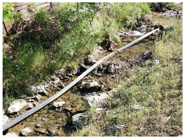
Figure 4. A water pipe draining the stream source for agricultural irrigation.