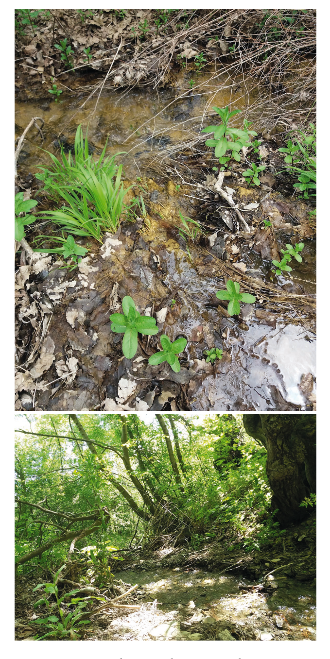
Figure 2. Aquatic and terrestrial vegetation: the upper image shows aquatic plants, 22 April 2020, and the lower image shows trees around the stream, 17 May 2020.

acteristics of the terrestrial habitat of Derjugin's Mountain Newt around the stream are a steeply sloped forest habitat with a sparse covering of oak trees in grassland. This species was present at altitudes above 1,000 m, and its density and presence increased with increasing altitude. Based on the studies of AFROOSHEH et al. (2016), which examined the distribution of the Yellow-spotted Newt ( Neurergus d. microspilotus ) in western Iran, all localities of this taxon ranged between 630 and 2057 m above sea level. The ter-