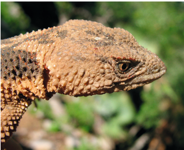
Figure 1. A Flathead Knob-scaled Lizard, Xenosaurus platyceps , from Tamaulipas, Mexico, with mites on the neck.

Mite prevalence in both populations tended to be higher from April through either October (Gómez Farías) or January (El Madroño). This pattern is similar to that observed in X. fractus (where the prevalence was higher in August than in November), but contrasts with that observed in X. rectocollaris (where the prevalence was higher in October than in July, see OLVERA ARRIETA 2017). Our results