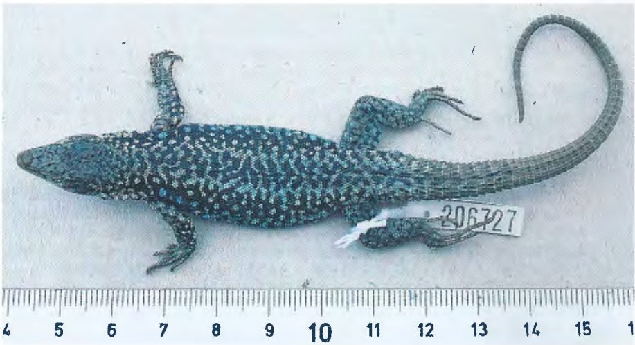
Fig. 2. Dorsal aspect of a male specimen of Darevskia v. valentini from Ohio (KU 206727). Scale in cm.

Ventralansicht des Schwanzes einer männlichen Darevskia v. valentini Ohio (KU 206727). Man beachte die alternierenden schmalen und breiten Schwanzwirtel.