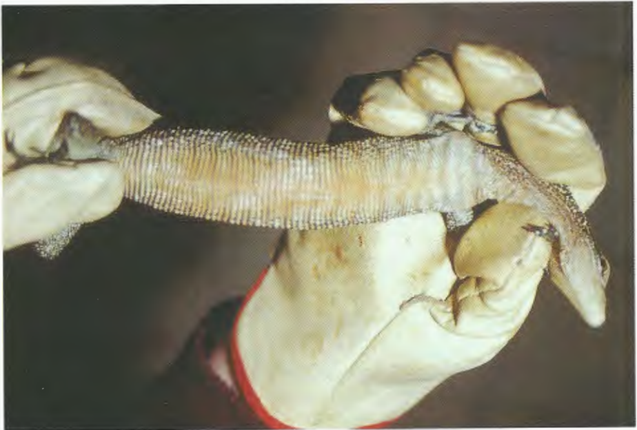
Fig. 6. Paratype IV of Varanus boehmei sp.n., subadult female, ventral view. Paratypus IV von Varanus boehmei sp.n., subadultes Weibchen, Ventralansicht.