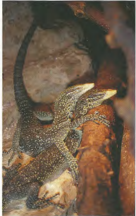
Fig. 4. Paratypes I and V of Varanus boehmei sp.n. (female below, male on top). Paratypus I und V von Varanus boehmei sp.n. (Weibchen unten, Männchen oben).