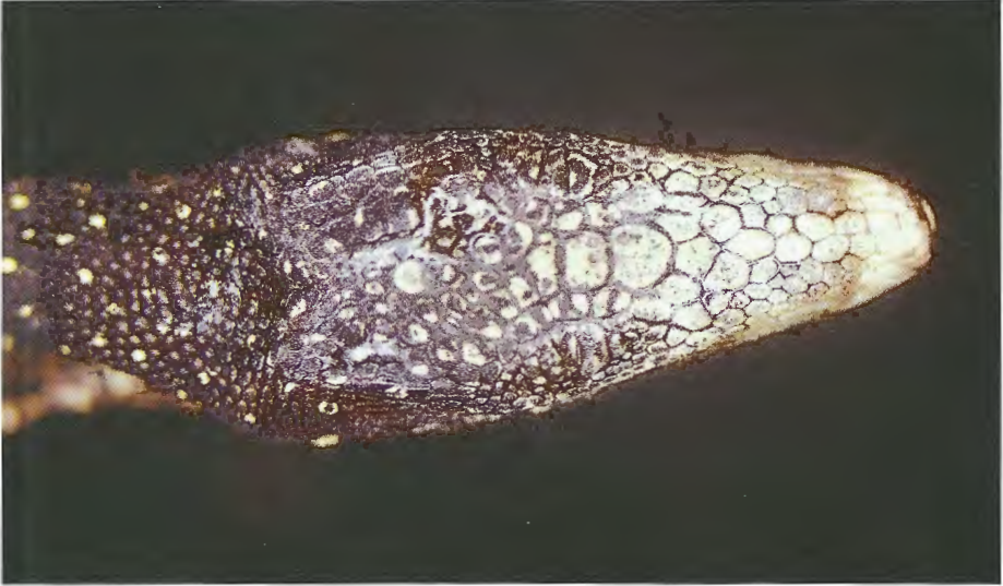
Fig. 3. Holotype of Varanus boehmei sp.n. (ZFMK 77837), dorsal aspect of the head. Holotypus von Varanus boehmei sp.n. (ZFMK 77837), Dorsalansicht des Kopfes.