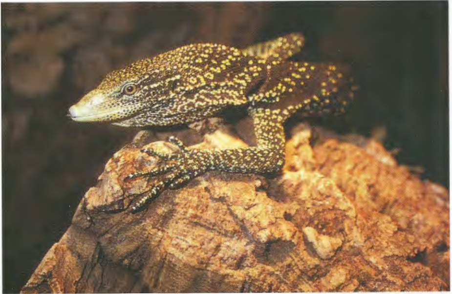
Fig. 5. Paratype III of Varanus boehmei sp.n., adult male. Paratypus III von Varanus boehmei sp.n., adultes Männchen.