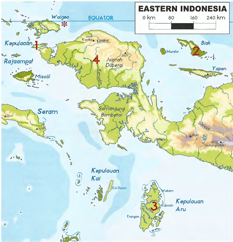
Fig. 7. Distribution of the species of the Varanus prasinus group in West Irian / Verbreitung der Arten der Varanus prasinus Gruppe in West Irian. * – Waigeo (type locality V. boehmei sp. n.); 1 – Batanta ( V. macraei ); 2 – Biak ( V. kordensis ); 3 – Aru ( V. beccarii ); 4 – Vogelkop ( V. prasinus ).

Derivatio nominis: I name the new species in honour of WOLFGANG BÖHME, Professor of Zoology (Zoologisches Forschungsinstitut und Museum Koenig, Bonn, Germany), long-standing president of the German Herpetological Society (DGHT), and one of the internationally best-known monitor-researchers. By analogy with the English derivate I suggest the German trivial name: “Goldgefleckter Baumwaran”.