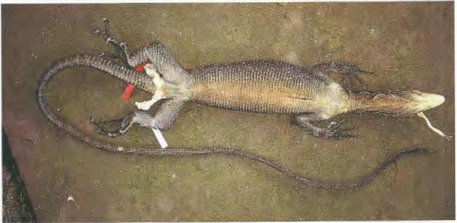
Fig. 2. Holotype of Varanus boehmei sp.n. (ZFMK 77837), ventral view. Holotypus von Varanus boehmei sp.n. (ZFMK 77837), Ventralansicht.

scales elongated. Dorsal side of limbs covered with weakly keeled scales. Ventral part of the limbs covered with mostly rounded scales.