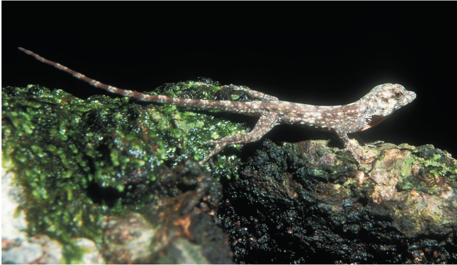
Fig. 2. Released juvenile N. utilensis at the nesting place one day after hatching.

Freigelassenes Jungtier von N. utilensis am Ablageplatz einen Tag nach dem Schlupf.