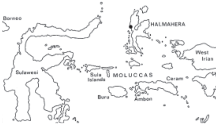
Fig. 6. At present, Varanus zugorum sp. n. is only known from its type locality on the Moluccan island of Halmahera, Indonesia.

tor lizards by ZIEGLER & BÖHME 1997). However, a careful dissection of the left inverted genital organ, in total ca. 1 cm long, revealed a sperm groove which distinctly widens towards the end of the inverted organ and a large hemibaculum-like structure (that means a hemibaculum or hemibaubellum) on one side of the genital organ before turning out into the retractor muscle (Fig. 3). Due to the delicateness of the invertedly opened genital organ no other structures (i. e., second hemibaculum-like structure or paryphasmata) could be determined with certainty. The ca. 2.3 mm long, shovel-shaped hemibaculum-like structure that could be detected was distinctly broadened towards its tip which revealed at least eight tiny indentations (Fig. 4).