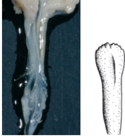
Figs. 3 & 4. Removed and invertedly dissected left outer genital organ of the holotype of Varanus zugorum sp. n. (USNM 237439); note the diagnostically shovel-shaped hemibaculum-like structure below on the left. The latter is drawn in Fig. 4 (right).

Teeth slender, relatively pointed and slightly recurved.