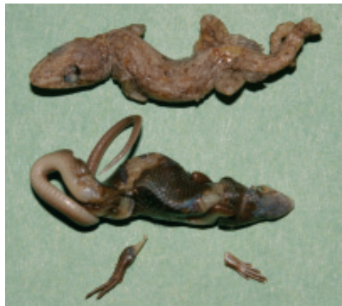
Fig. 5. Stomach contents of the holotype of Varanus zugorum sp. n. (USNM 237439): gecko above, skink below.

Due to the tiny genital structures of the juvenile type specimen the right inverted genital organ failed to be everted after the method described by Pesantes (1994; and first applied also for female organs in moni-