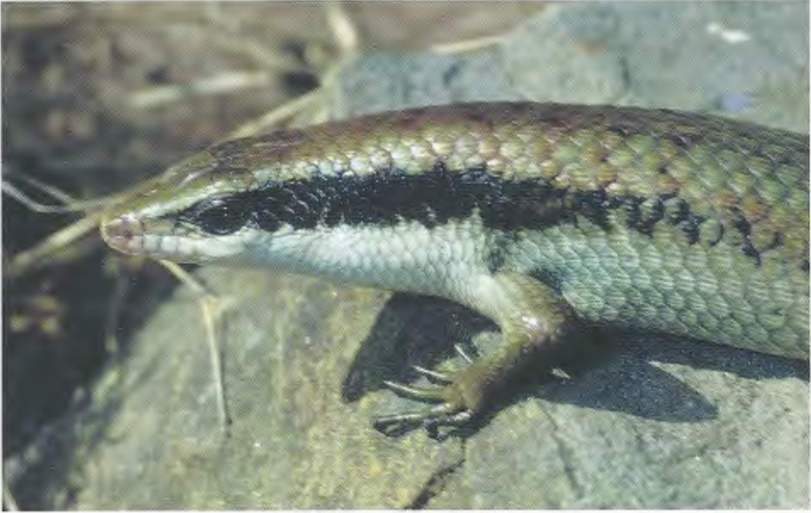
Fig. 4. Lateral view of head of the paratype of Mabuya macrophthalmalma sp. nov. (ZFMK 71716).

Seitliche Kopfansicht des Paratypus von Mabuya macrophthalmalma sp. nov. (ZFMK 71716).