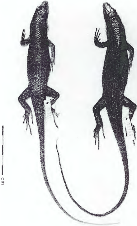
Fig. 1. Dorsal view of holotype (left: ZFMK 71717) and paratype (ZFMK 71716) of Mabuya macrophthalmia sp. nov.

12.6 mm; head height at centre of eyes 8.9 mm; limbs from inner base to claw tip of fourth finger and toe, respectively: forelimbs 34.3/34.5 mm, hindlimbs 60.7/57.3 mm; hindlimbs reach elbows when adpressed to body; lengths of fourth fingers 10.2/10.5 mm, and of fourth toes 15.9/15.3 mm; tail width at its base 14.0 mm.