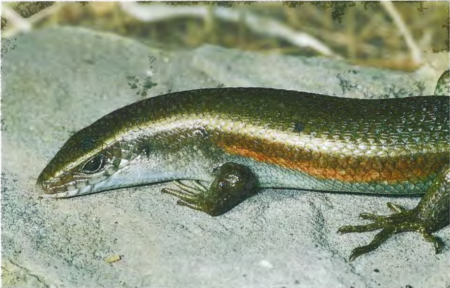
Fig. 5. Lateral view of Mabuya multifasciata (ZFMK 71718) from Java, Indonesia.

Seitliche Kopfansicht des Paratypus von Mabuya macrophthalmalma sp. nov. (ZFMK 71716).