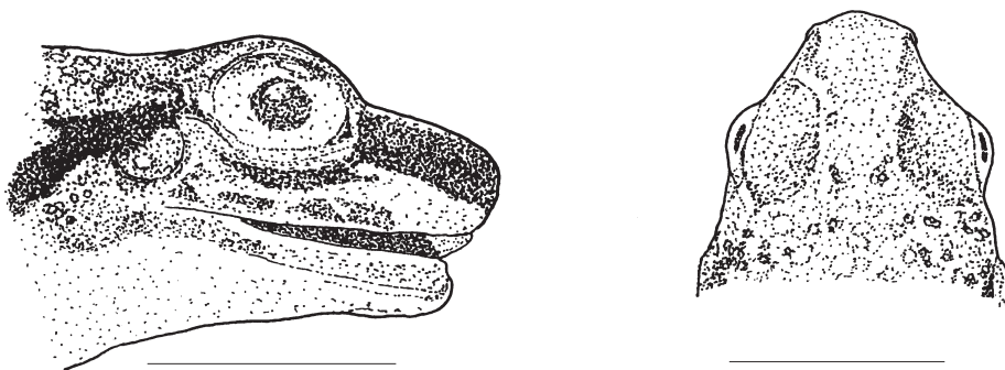
Fig. 7. Lateral and dorsal views of head of Colostethus wothuja sp. n. (EBRG 4760). Scale equals 5 mm.

Lateral- und Dorsalansicht des Kopfes von Colostethus wothuja sp. n. (EBRG 4760). Die Linie entspricht 5 mm.