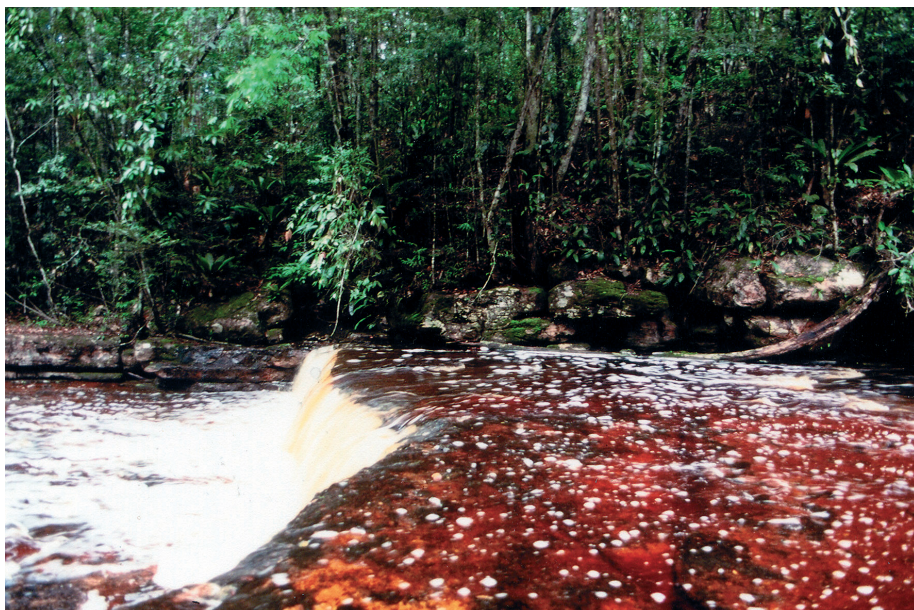
Fig. 4. Stream on the Cerro Santa Rosa summit; type locality of Colostethus triunfo sp. n. Bachlauf auf dem Gipfel des Cerro Santa Rosa; Typuslokalität von Colostethus triunfo sp. n.