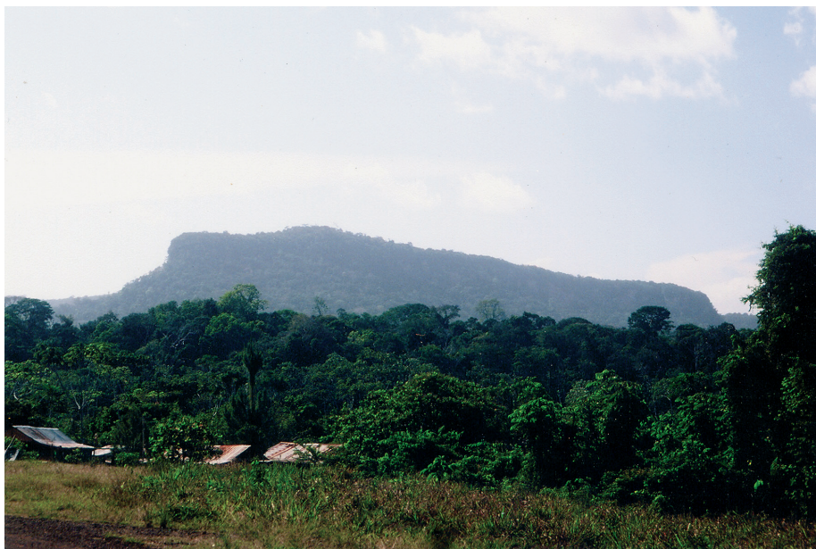
Fig. 3. View of Cerro Santa Rosa from Triunfo camp site. Ansicht des Cerro Santa Rosa vom Triunfo camp.