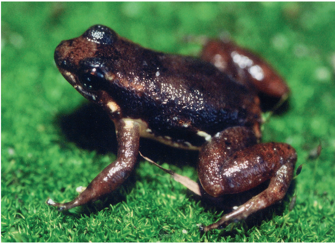
Fig. 6. Colostethus wothuja sp. n. in life/ im Leben.