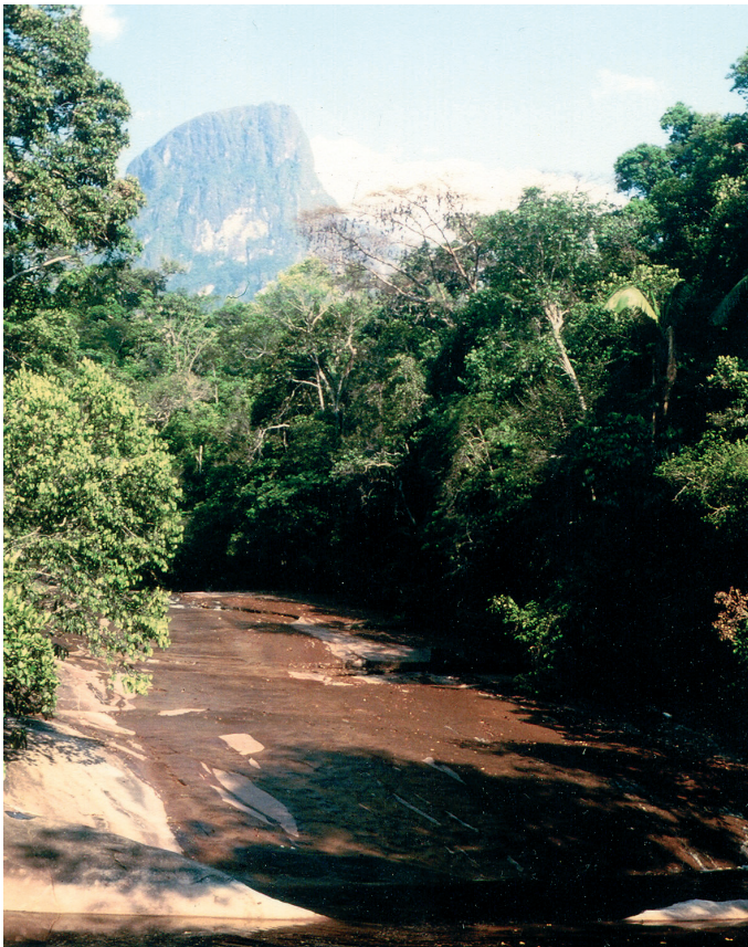
Fig. 9. View of Serranía del Cuao with the stream from where the type series of Colostethus wothuja sp. n. was collected.

The oral disc Stage 31 (MHNLS 16720) is located ventrally and emarginated, 2.1 mm in transverse width, 38.9 % of maximum body width (Fig. 8). Margin of disc surrounded by irregular papillae of differing lengths; papillae present on upper lip, submarginal papillae absent. Marginal papillae conic-pointed, simple from lateral edges of upper lip to lower lip, they are arranged in a weak double row at the centre of lower lip; marginal papillae alternate, in a single row, surrounding the oral disc, except for a gap superiorly. Labial tooth row formula 2(2)/3(1). Tooth row A-1 complete, equal in length than A-2, extended near the marginal papillae, 1.95; A-2 consist in two rows, separated by a diastema (0.92 and 0.93) (gap 0.38), extended above of upper jaw sheath. Upper jaw partially keratinised, as wide as high, arched, convex medially, with minute serrations; with short, lateral processes; jaw sheath broadly V-shaped, partially keratinised. Both upper and lower sheaths finely serrated; serrations extend entire length of sheaths, including lateral processes. Row P-1 with a short gap (0.82 and 0.83) (gap 0.06); row P-2 longer than P-1, 2.15 mm; P-3 the shortest, 1.82 mm.