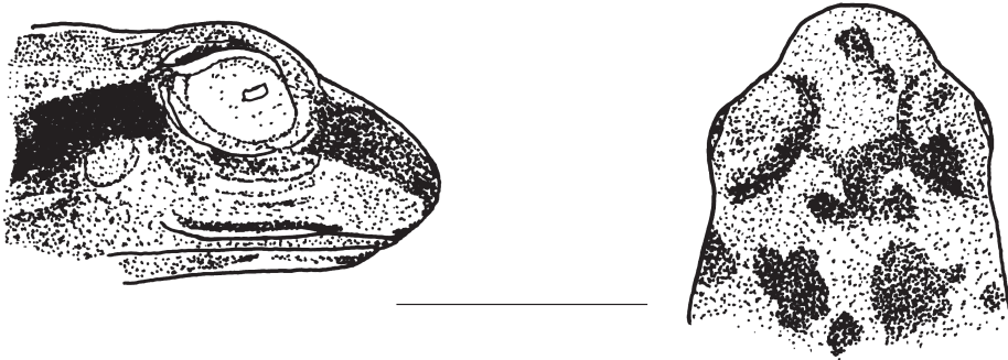
Fig. 2. Lateral and dorsal views of head of Colostethus triunfo sp. n. (EBRG 4757). Scale equals 5 mm.

Lateral- und Dorsalansicht des Kopfes von Colostethus triunfo sp. n. (EBRG 4757). Die Linie entspricht 5 mm.