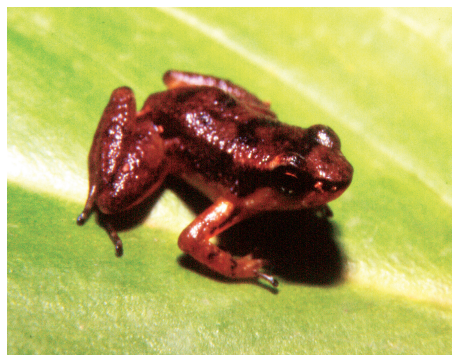
Fig. 1. Colostethus triunfo sp. n. in life/im Leben.