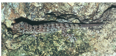
Fig. 13. Gekko mindorensis from Panay, Iloilo Province, Mun. Dingle, Bulaboc Puti-an Nationalpark.

The non-topotypic paratypes of G. ernstkelleri have a SVL of 45.0-92.0 mm and a TL of 60.0-119.0 mm. Their variation range of scalation characters is: supralabials, 12-15; supralabial beneath center of eye, 10-12; infralabials, 10-13; nasals, 3; internasal single; interorbitals, 41-46; spiny ciliaries, 4 or 5; postmentals, 2; scales bordering postmentals, 6-8; tubercle rows across midbody, 11-14; dorsal tubercles surrounded by 10-11 granules; ventrals, 38-44; subdigital scanners on first finger, 14-18, on fourth finger, 16-19, on first toe, 15-16, on fourth toe, 17-19; preanofemoral pores, 36-42; postcloacal tubercles, 2.