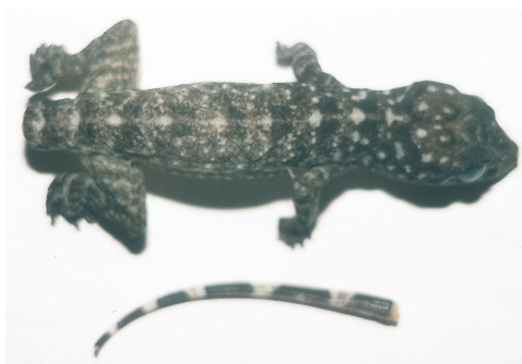
Fig. 12. Paratype (PNM 9082, male, juvenile) of Gekko ernstkelleri sp. n., dorsal view.