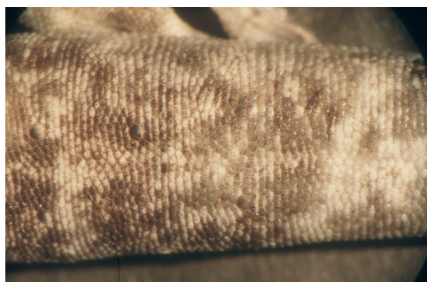
Fig. 5. Dorsal view of anterior part of tail of Gekko ernstkelleri sp. n., holotype (PNM 9080).