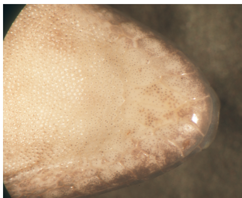
Fig. 4. Mental region of Gekko ernstkelleri sp. n., holotype (PNM 9080).

squarish or quadrangular spots on either side of the vertebral line. (TAYLOR 1925, BROWN & ALCALA 1978, ALCALA 1986, see discussion). Gekko porosus TAYLOR, 1922: is only known from one juvenile specimen with a SVL of around 50.0 mm. Ventrals 42, dorsal tubercle rows 16 (versus 11-15), dorsal surfaces of extremities with tubercles (versus tubercles on dorsal surface of fore limbs absent). Dorsum tan to light brown, with a faint indication of wide, darker and lighter transverse bands. (TAYLOR 1922, BROWN & ALCALA 1978, ALCALA 1986). Gekko romblon BROWN & ALCALA, 1978: SVL up to 88.5 mm, interorbitals 36-38 (versus 39-46), ventrals more than 40, preanofemoral pores 70-81 (versus 36-42), dorsal tubercle rows 12-14; tubercles small. Dorsal ground colour reddish-grey to dark