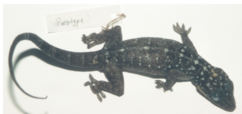
Fig. 11. Paratype (PNM 9081, female, adult) of Gekko ernstkelleri sp. n., dorsal view.