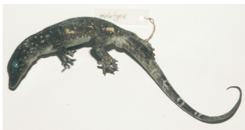
Fig. 7. Holotype (PNM 9080, male, adult) of Gekko ernstkelleri sp. n., dorsal view.

% diameter of eye. Intraorbital scales 40, with the scales adjacent to orbit largest. Head scales granular, half the size of medial snout scales. Head tubercles small, round, convex; tubercles between eye and auricular opening twice as large as tubercles on cranium. Mental triangular, as long as broad, not as wide as rostral. Infralabials 11/10. Postmentals two, twice as long as wide, bordered by mental, 1 st infralabial and 8 small scales (Fig. 4). Gular scales granular, 1.5 times larger than scales on head. Dorsals granular, as large as head scales. Dorsal tubercles round, smooth, convex, approximately four to five times as large as dorsals, arranged in 14 irregular, transverse rows at midbody. Ventrals flat, smooth, subimbricate, two to three times larger than dorsals. Ventrals across mid-