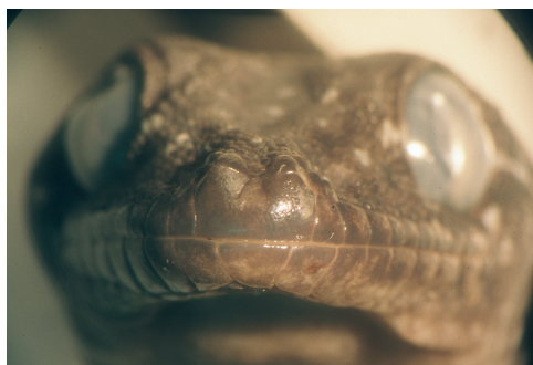
Fig. 1. Rostral scale of Gekko ernstkelleri sp. n., holotype (PNM 9080).