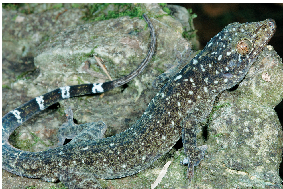
Fig. 9. Gekko ernstkelleri sp. n. (KU 300198, male, adult) within its habitat; Panay, Antique Province, Mun. Pandan, Brgy. Duyong, Duyong hillsite.

longitudinal row. Subcaudals divided in first caudal whorl, along rest of tail two relatively short subcaudal scutes interchange with one larger subcaudal scute. The short subcaudal scutes are laterally bordered by two, and the large one by three scales. The first scale of each caudal whorl is a large subcaudal scute (Fig. 6). On regenerated tails, dorsal scales are flat and smooth and ventral scales are enlarged.