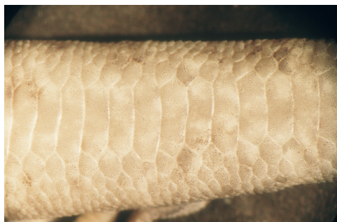
Fig. 6. Subcaudals of Gekko ernstkelleri sp. n., holotype (PNM 9080).

% diameter of eye. Intraorbital scales 40, with the scales adjacent to orbit largest. Head scales granular, half the size of medial snout scales. Head tubercles small, round, convex; tubercles between eye and auricular opening twice as large as tubercles on cranium. Mental triangular, as long as broad, not as wide as rostral. Infralabials 11/10. Postmentals two, twice as long as wide, bordered by mental, 1 st infralabial and 8 small scales (Fig. 4). Gular scales granular, 1.5 times larger than scales on head. Dorsals granular, as large as head scales. Dorsal tubercles round, smooth, convex, approximately four to five times as large as dorsals, arranged in 14 irregular, transverse rows at midbody. Ventrals flat, smooth, subimbricate, two to three times larger than dorsals. Ventrals across mid-