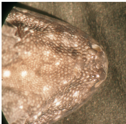
Fig. 2. Nasal region of Gekko ernstkelleri sp. n., holotype (PNM 9080).

ventrals more than 30, preanofemoral pores 48-60 (versus 36-42), dorsal tubercle rows 16-19 (versus 11-15). Dorsal ground colour tan to dark greyish tan, generally with diffuse, darker markings, usually forming more or less distinct transverse bands. (TAYLOR 1919, 1922, BROWN & ALCALA 1978, ALCALA 1986, see discussion too). Gekko palawanensis TAYLOR, 1925: SVL 63.0 mm (versus up to 92.0 mm), ventrals 36-44, preanofemoral pores 65-70 (versus 36-42), dorsal tubercle rows 8-12 (versus 11-15). Dorsum greyish to reddish-brown, with a series of darker brown