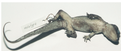
Fig. 8. Holotype (PNM 9080, male, adult) of Gekko ernstkelleri sp. n., ventral view.

body 41. Anteroventral forelimb scales flat, smooth, imbricate; dorsoposterior forelimb scales very small. Dorsal scales on anterior thigh flat, smooth, imbricate; posterior thigh scales very small. A few round, convex tubercles present between finely granular scales of hindlimbs.