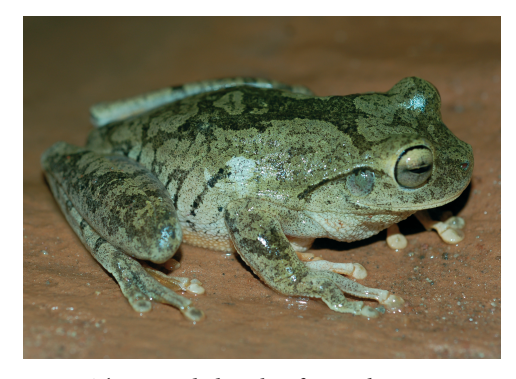
Fig. 3. The recorded male of Hypsiboas crepitans in life. Santana do Riacho, Serra do Cipó, Minas Gerais State, Brazil.

dominant frequency (350 Hz), and the pulse number (3-11) of calls from Colombia are lower than ours. In the Panamanian populations the call is trilled, shorter (200 ms), and presents a lower rate of emission (20/min.) compared to ours. Considering the extensive geographical distribution and the great inter-populational variability in color, body size, advertisement call, and breeding biology, several different species may be included under the name H. crepitans (Kluge 1979, Duellman 2001, Lynch & Suárez-Mayor-