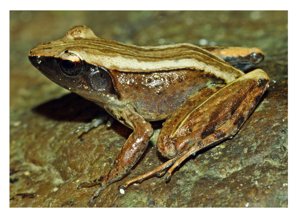
Figure 1. Calling male of Mantidactylus aerumnalis (MRSN A6362), photographed at Betampona Strict Nature Reserve (Sahaïndrana site) on 14 November 2007.

audiospectrogram was obtained using a Hanning window function with 256-band resolution. Temporal measurements are given as range, followed by mean \pm standard deviation and number of analysed units (notes, calls or intervals).