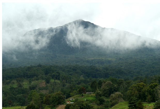
Figure 1. Páramo el Tambor and surroundings, natural macrohabitat of Bolitoglossa spongai .

tion. Cloud forest (Fig. 2) forms a belt surrounding the Páramo El Tambor (Fig. 1), which is like an island, separated from the rest of the Sierra La Culata by a valley with