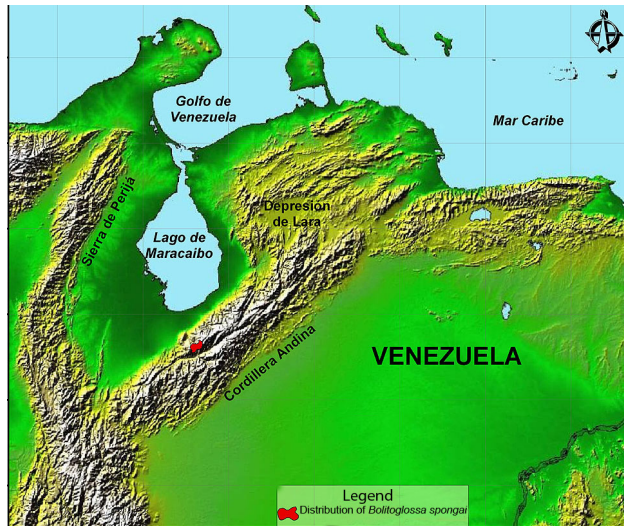
Figure 6. Distribution map of Bolitoglossa spongai in the Venezuelan Andes.

Pattern A (Figs. 3b, c, 4d): Typical: the pattern reported for the holotype and the most abundant (64 %; 18 males, 12 females, two juveniles). It consists of a pale to dark brown dorsum, sometimes with a few ill-defined darker spots or stripes, darker flanks, and not well delimited, white metallic marks on any part of the animal.