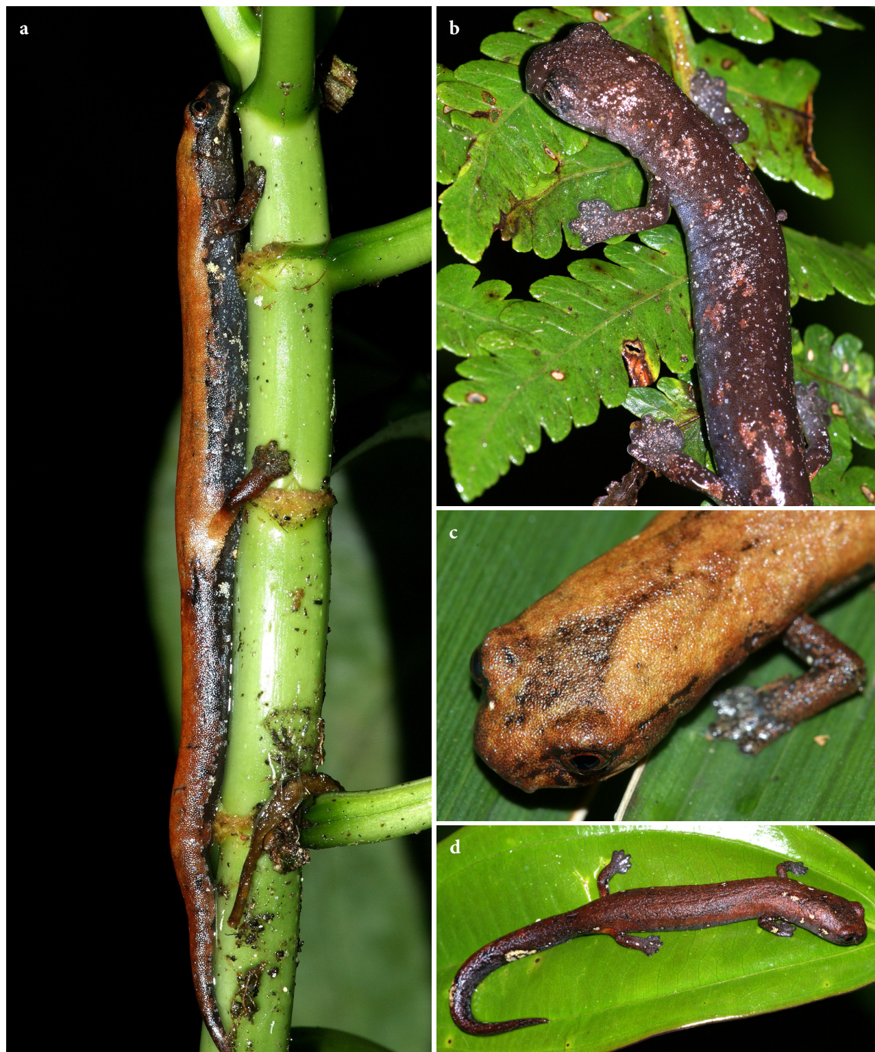
Figure 4. Bolitoglossa spongai . a) Vertical position of female 24; b) Female 06, on a type 3 plant (fern), vertically ascending. Also representative of pattern E; c) Close-up showing the rhomboidal marking typical of the species; d) Female showing Pattern A (see also Fig. 3b).

ture that night was 11.1°C, colder than the previous night. We observed two males, two females, and one juvenile. All were located at heights from 50 to 200 cm.