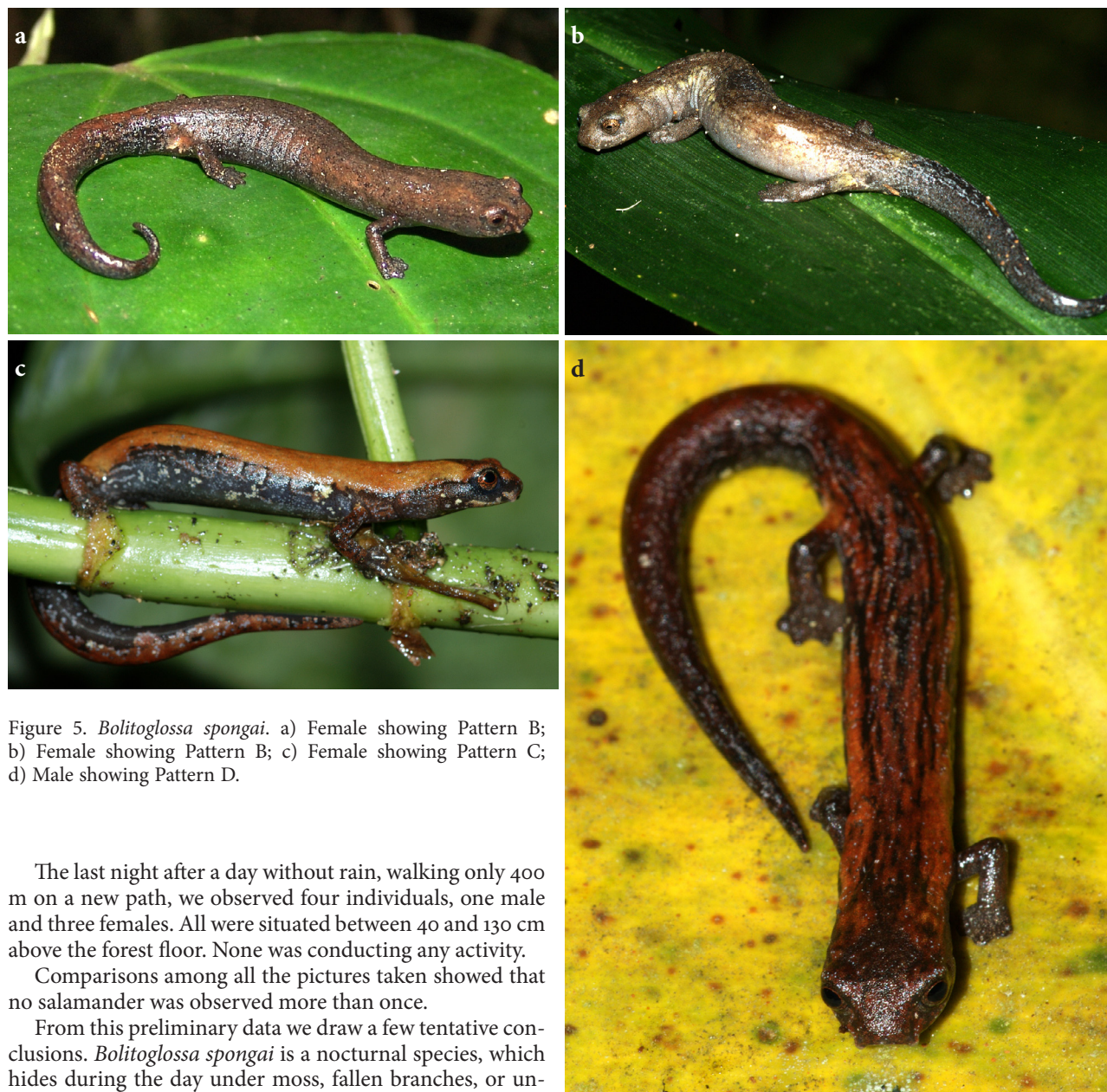
Figure 5. Bolitoglossa spongai . a) Female showing Pattern B; b) Female showing Pattern B; c) Female showing Pattern C; d) Male showing Pattern D.

The last night after a day without rain, walking only 400 m on a new path, we observed four individuals, one male and three females. All were situated between 40 and 130 cm above the forest floor. None was conducting any activity.