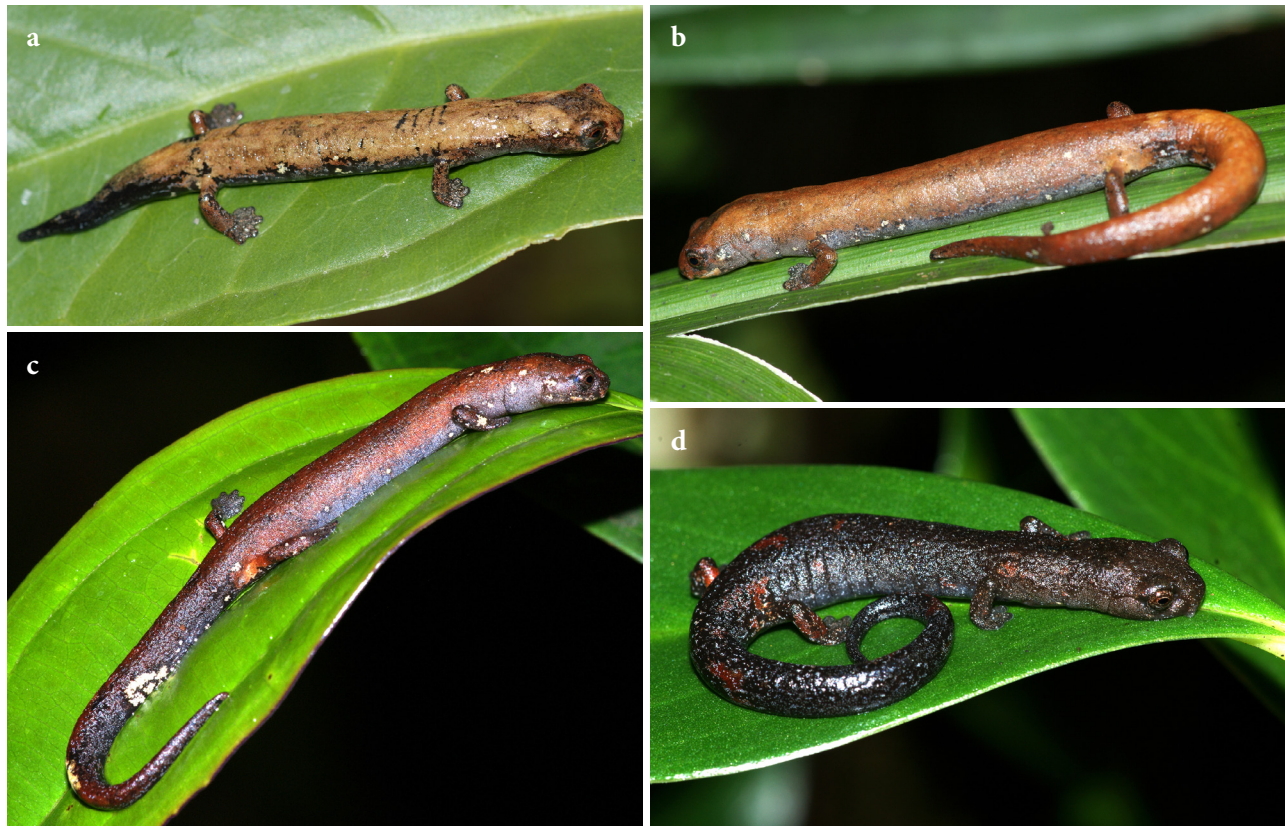
Figure 3. Bolitoglossa spongai . a) Female 05, with regenerated tail; b) Female 30 on type 1 plant ( Pittcairnia ), diagonally descending; c) Female 11 on type 2 plant ( Cavendishia ), diagonally ascending; d) Female 23 on type 2 plant ( Clusia ), horizontal. Also representative of pattern E.

intense anthropogenic activity (deforestation, cultivation, cattle farming). During four nights (24, 26, 28 and 29 July), we walked paths within the property, in cloud forest (Fig. 2), in order to observe amphibians and biodiversity in general. Each walk lasted about two hours, whereby a total of 16 hours was spent searching (counting two hours per night per four nights per two persons).