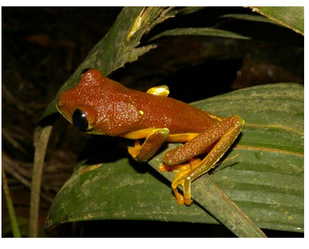
Figure 4. Individual showing a reddish brown colouration at night.

with the next calling male located at least 20 m away and no aggressive interactions with other specimens could be observed. The call was recorded on 15 October 2006 at 21:00 h at an air temperature of 18.8°C and 99% relative humidity. The weather was foggy with a moderate breeze. Condensed water was dripping from the vegetation. We recorded six calls of the mentioned male, the second of which is visualized in Figure 2, as a representative example. Every recorded call consisted of five notes. Call duration was between 0.67 and 0.72 s, with an interval between calls ranging from 11.05 to 32.22 s(18.15 \pm 7.27 s; n = 5). The call rate during recording was 4.38 calls per minute. Note