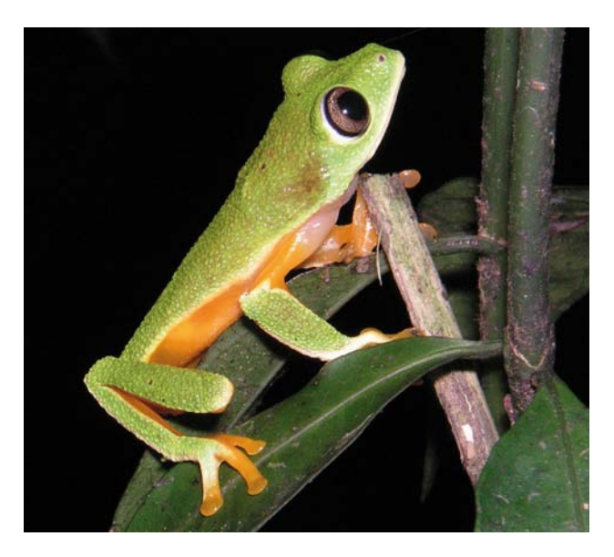
Figure 1. The recorded male of Hylomantis medinae at its calling site.