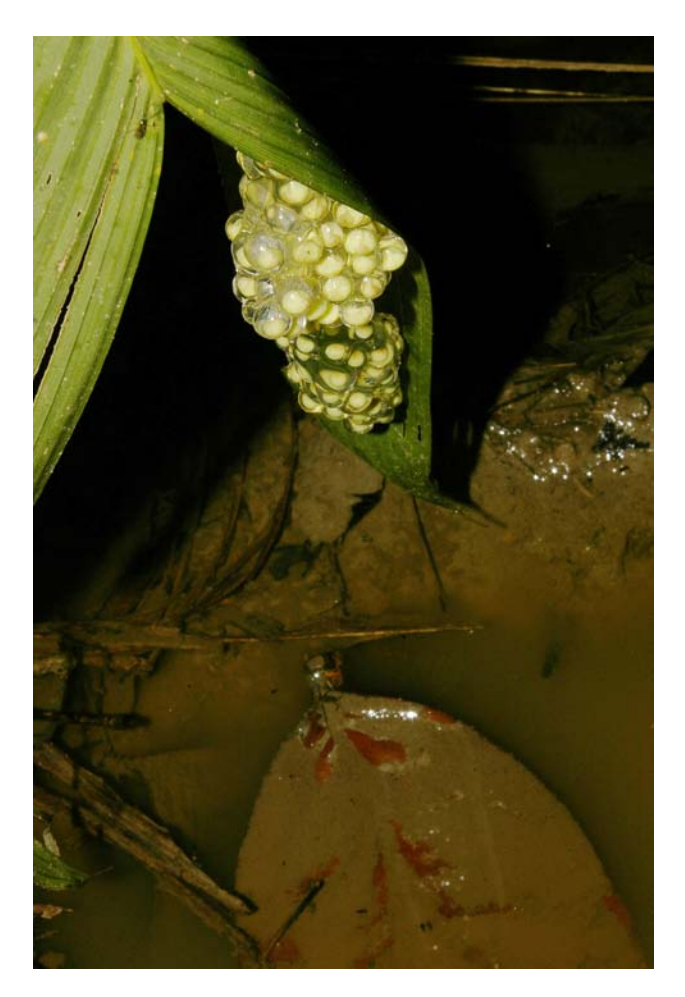
Figure 5. Egg clutch on palm leaf above the water surface.

call duration of 0.04 to 0.05 s and a dominant frequency of 1900 Hz. The advertisement call of H. lemur from Panama and Costa Rica was described by JUNGFER & WEYGOLD (1994) as a 'simple tick' of 0.19 to 0.2 s duration repeated at irregular intervals, that vary from 12 s to several minutes, and a dominat frequency of 1400 to 3100 Hz. The advertisement call of H. aspera from Brazil was described by PI-MENTA et al. (2007) as a sequence of three or four short and close pulses with a mean call duration of 0.03 s and a dominant frequency between 1679.59 and 2110.00 Hz. Since all these species look similar, the differences in their respective advertisement calls, besides geographic distribution, are likely to present important tools for identification by the time that more advertisement calls of species of the genus will be available.