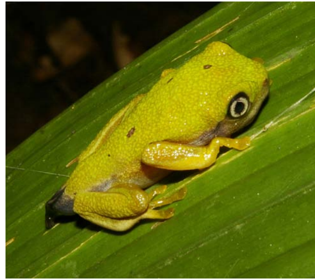
Figure 3. Recently metamorphed specimen on palm leaf.