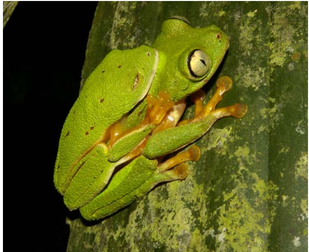
Figure 6. The collected pair at daytime.

We found at least a dozen adult individuals of H. me dinae in and around a natural body of lentic water that is situated in a depression between two peaks, right on the ridge of Cerro Zapatero. In the water, we observed numerous tadpoles and a single adult of unknown sex, that disappeared in the water before we were able to collect it. Within a radius of about 5 m from the water, we encountered one calling male, amplectant pairs, single non-calling individuals of unknown sex, and two recently metamorphosed specimens (Fig. 3). Additional males