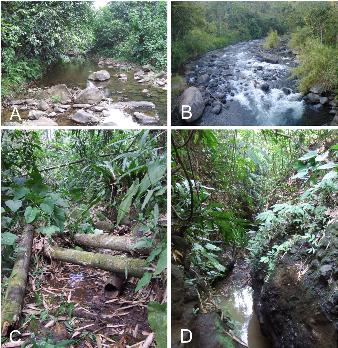
Figure 2. Prospected sites. (A) Site 1, Piglarn stream near Poblacion; (B) and (C) Site 2 within the forest and adjacent Kulaman River, respectively. (D) Site 3 near Culasi.

A complete list of species previously recorded from within the MKRNP and records from the current study per