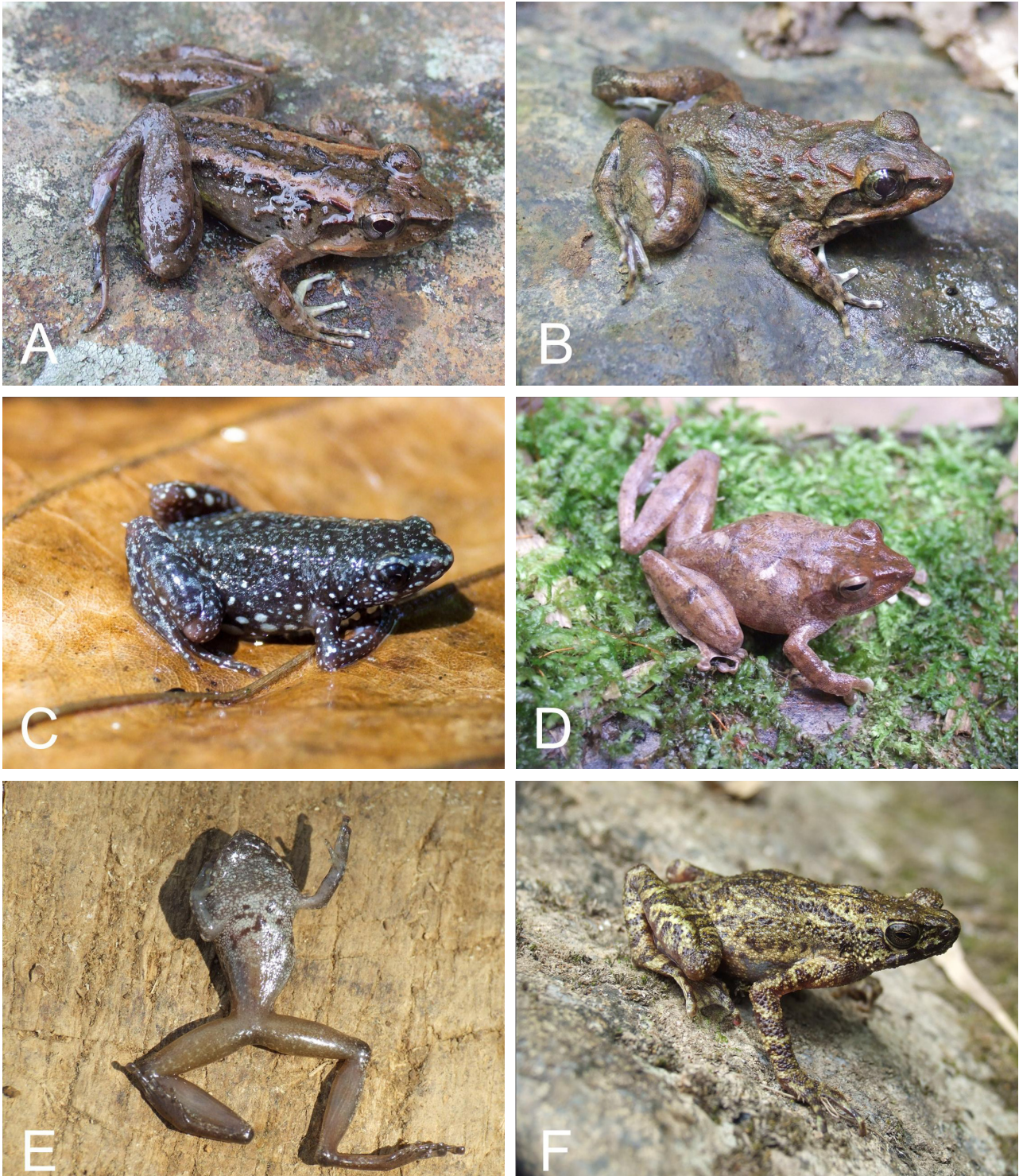
Figure 3. Anurans encountered in the Mt. Kitanglad Range. (A) Limnonectes leytensis ; (B) Limnonectes diuatus ; (C) Chaperina fusca ; (D) Philautus leitensis ; (E) Philautus sp.; (F) Ansonia muelleri .

site can be found in Table 1. In addition to these verified records, a dark Brachymeles sp. was observed at Site 2, but could not be caught for identification. In total, 12 reptile- and 10 amphibian species were located of which 15 had not previously been recorded from the MKRNP. A selected number of species representing either geographically or morphologically noteworthy records are discussed below.