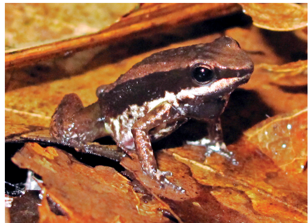
Figure 1. Male Allobates nidicola (INPA-H 28607), photographed while calling at Ilha da Pedra, in November 2010.

In order to confirm the specific identity of, and to provide data on call parameters for this population, we recorded advertisement calls of five males (three at Cachoeira de Teotônio and two at Ilha da Pedra, INPA-H 15774–15776 and INPA-H 16082–16083, respectively) with a Marantz PMD 660 digital recorder and a Sennheiser ME 66 directional microphone positioned approximately 1 m from each focal individual. Calls were analysed with Raven 1.2 (CHARIF et al. 2004). For each male recorded, ten calls evenly distrib-