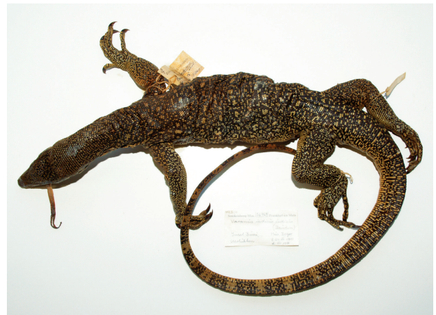
Figure 4. A voucher specimen of V. rainerguentheri (SMF 56469) from Buru that confirms the new island record.

Subsequent research (WEIJOLA 2010), utilizing both field observations and museum voucher specimens, considerably expanded the species' range throughout the northern Moluccas (North Maluku Province) to include the following islands: Halmahera, Morotai, Ternate, Tidore, Gebe, Kasiruta, Bacan, and Obi. Our review of museum specimens previously assigned to V. indicus indicates that V. rainerguentheri is also present on Buru. SMF 56469 (Fig. 4) represents the first record of this species from the southern Moluccas (Maluku Province) and brings to nine the total number of islands that this species has thus far been recorded from (Fig. 5). The new island record of this historical voucher specimen of V. rainerguentheri is confirmed by a recent expedition to Buru, during which one subadult specimen could be collected (Fig. 6). Given that V. rainerguentheri represents a relatively newly described species and that there is still some uncertainty surround-