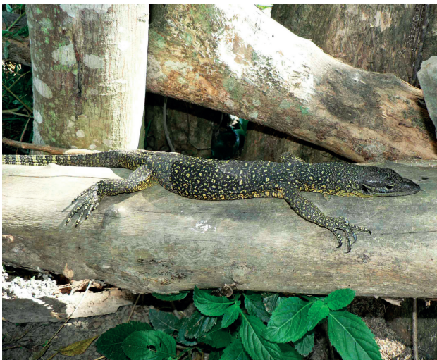
Figure 6. V. rainerguentheri from Buru, a new island record for this monitor species.

Due to the geographic proximity to the new locality record from Buru, it is very likely that V. rainerguentheri also inhabits the neighbouring Moluccan islands of Seram