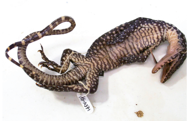
Figure 2. Juvenile V. rainerguentheri (USNM 215908) from Halmahera Island, ventral view.