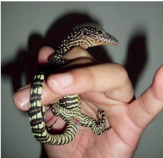
Figure 3. A pet-trade juvenile of V. cf. rainerguentheri lacking locality data.

Varanus rainerguentheri was originally described from Jailolo District, Halmahera, in the northern Moluccas.