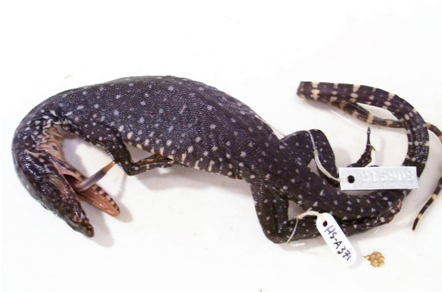
Figure 1. Juvenile V. rainerguentheri (USNM 215908) from Halmahera Island, dorsal view.