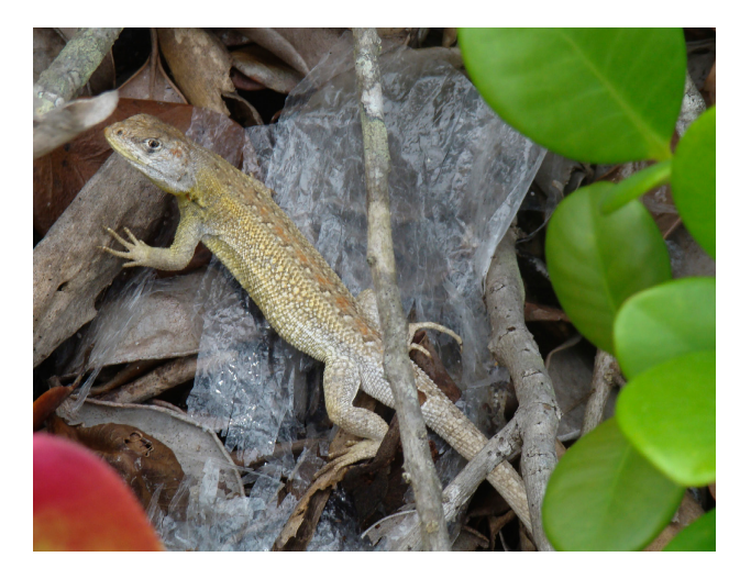
Figure 1. An individual of Liolaemus lutzae on a piece of plastic bag.

Restingas are habitats originating from the Quaternary that are characterized by sandy soils with high salt concentrations and a predominance of herbaceous and shrubby vegetation (SUGUIO & TESSLER 1984). Field sampling was conducted in a stretch of Restinga in Praia Grande (22°57' S, 42°02' W), municipality of Arraial do Cabo, state of Rio de Janeiro, southeastern Brazil (Fig. 2), near the Área de Pro-