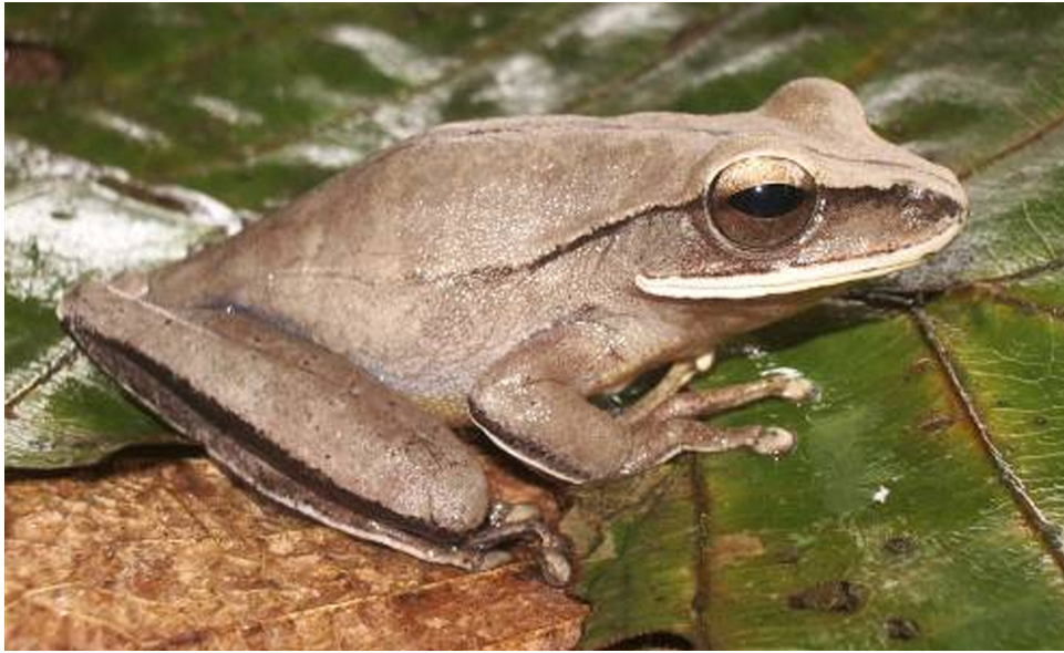
Figure 1. A live specimen of Hypsiboas leucocheilus from the type-locality (Aripuanã municipality), Mato Grosso, Brazil.

ber 2009, 21:40 h, at 22°C air temperature. The calling male was not collected, because it was perched about 3 m above the ground. Nine other anuran species were found calling in sympatry with H. leucocheilus at this site: Ameerega cf. picta (BIBRON in TSCHUDI, 1838), Dendropsophus marmoratus , Hypsiboas cinerascens (SPIX, 1824), H. geographicus (SPIX, 1824), Leptodactylus lineatus (SCHNEIDER, 1799), L. rhodomystax , Phyllomedusa hypochondrialis (DAUDIN, 1800), Pristimantis cf. fenestratus and Rhaebo guttatus .